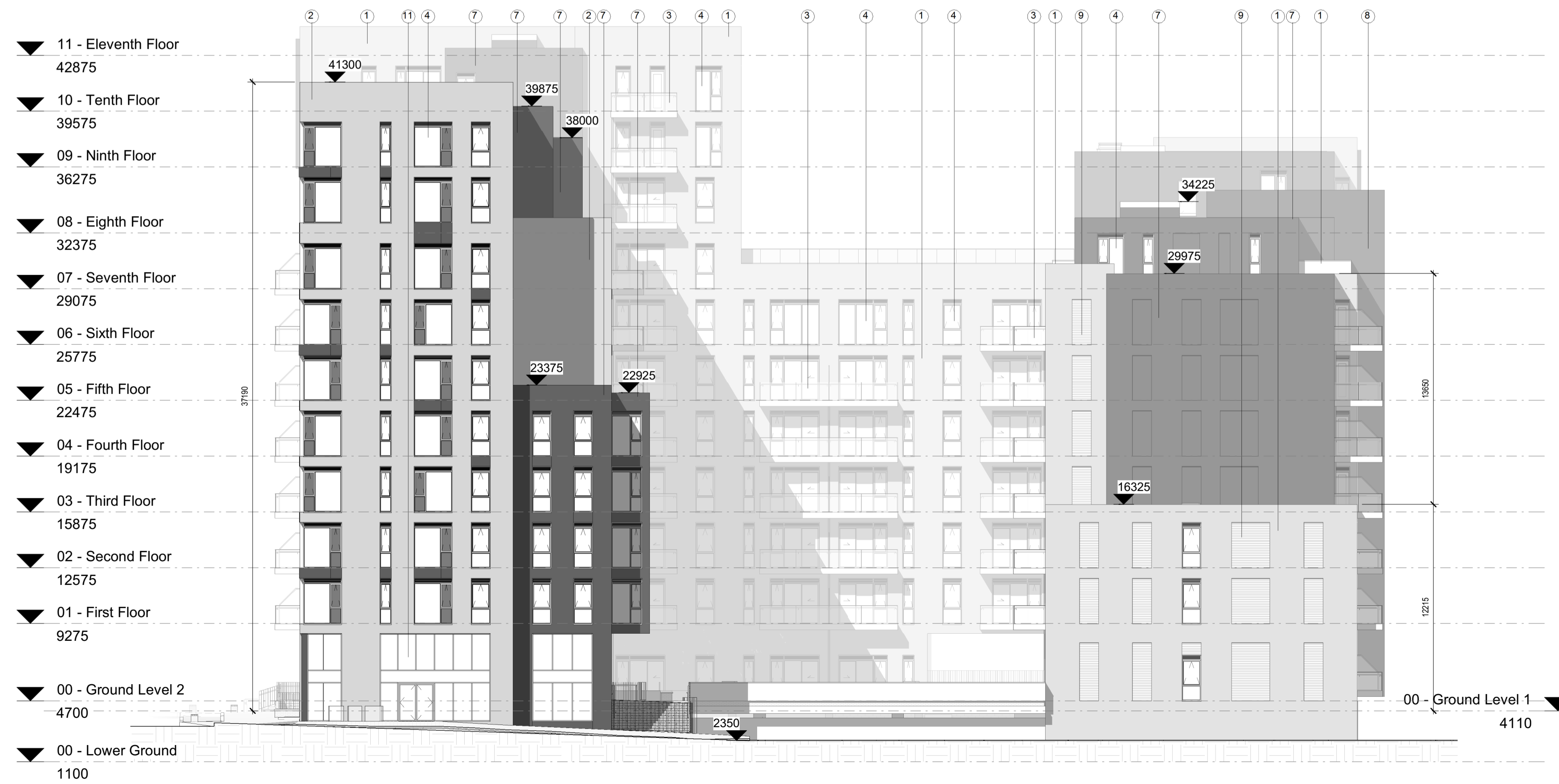
2 Block 2 - South Elevation 1 : 200