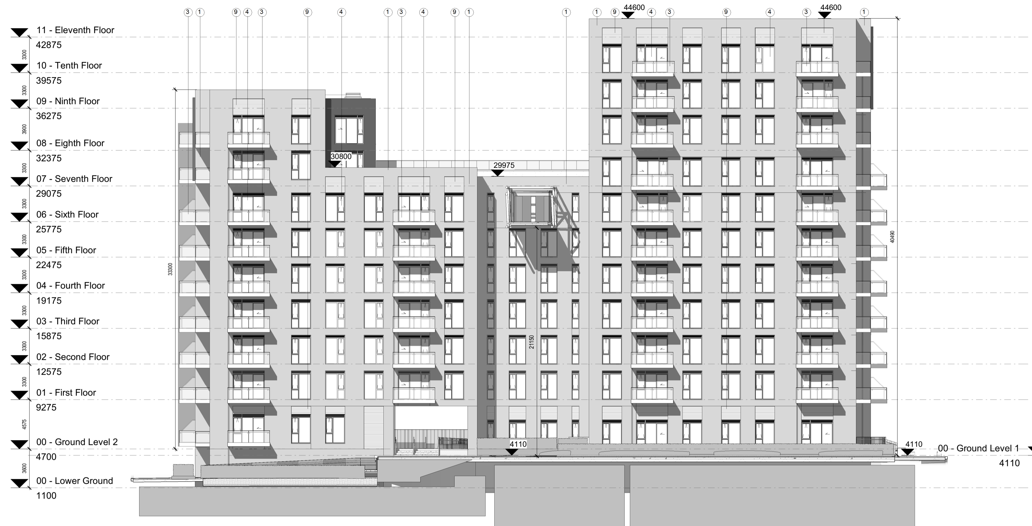
1 Block 2 - North Elevation 1 : 200

NOTE ALL DIMENSIONS TO BE CHECKED ON SITE NO DIMENSIONS TO BE SCALED FROM THIS DRAWING THIS DRAWING IS TO BE READ IN CONJUNCTION WITH RELEVANT CONSULTANTS DRAWINGS